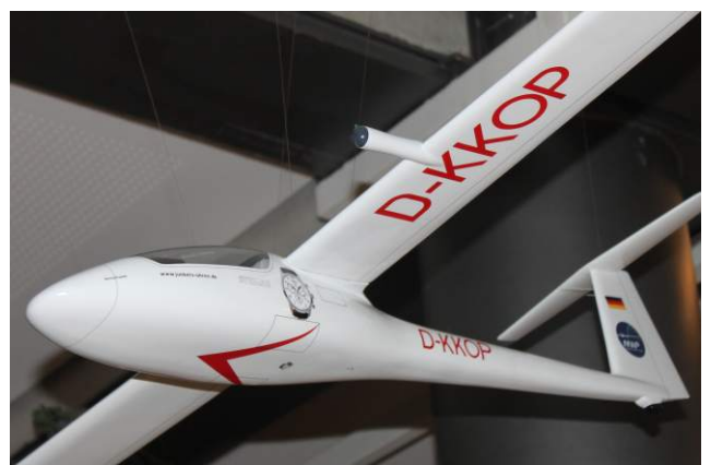
The Wind Force Sensor, a scientific tool of the Mountain Wave Project flights, sticks out of the leading edge of a 1:10 S10 model.

as can be seen in a German TV-documentation, shown in the Technical Museum reel-on-reel. Scientist and top-notch MWP pilot René Heise flew a specially equipped STEMME aircraft over the Andes in Argentina. The next research mission will be flown with a STEMME S10 in the Tibetan Highlands – in close cooperation with the Chinese Academy of Science.