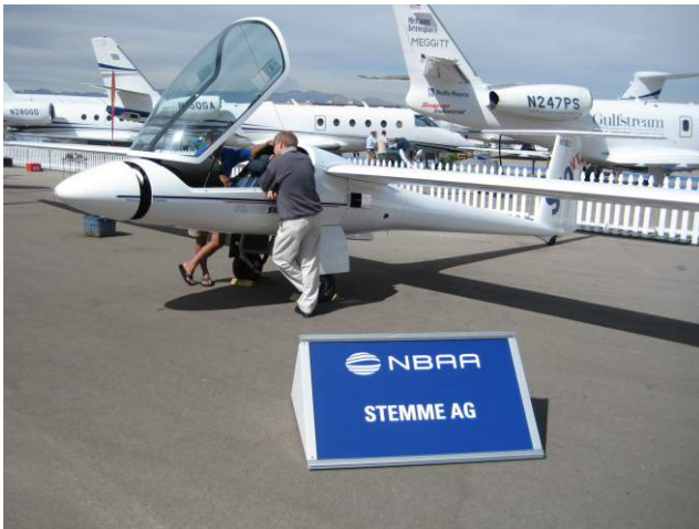
A motorglider among business jets – Stemme's flagship S10-VT felt very much at home at NBAA Convention Las Vegas, NV.