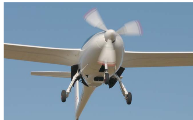
Stemme's all-new S6-RT on take-off, just before 'gear-up'. Next Stop: EAA AirVenture Oshkosh 2012.