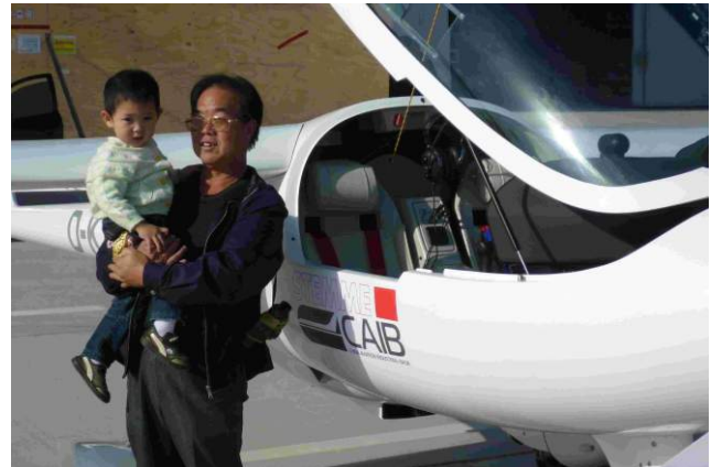
Daddy's boy: showing him the sleek and fast 'German Bird' from a far-away country - this is the future.

The Berlin-Brandenburg-Aerospace-Alliance's excellent organizational effort paid off handsomely for STEMME. Chinese interest in the new S6 Travelling Motorglider was intense and kept the STEMME Team busy answering technical questions.