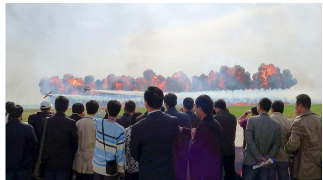
Mock explosions, fire and smoke from staged aerial combat kept the Xi'an Airshow visitors holding their breath.

Stemme's new flagship S6 model Travelling Motorglider was air-freighted in record time to the Xi'an Airshow and readied for demonstration flights by a crack Stemme technical team. Their effort was supported by the Berlin-Brandenburg-Aerospace-Alliance (BBA) and received full cooperation from CAIB.