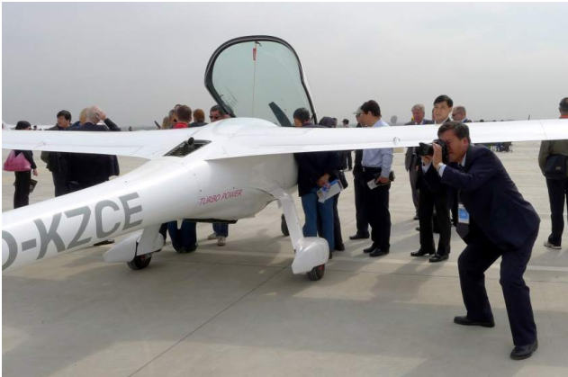
The Stemme S6's sleek lines draw a crowd.