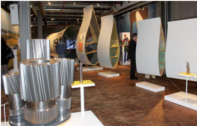
WIND FORCE exhibits in Berlin: on the magical border of art and technical design.