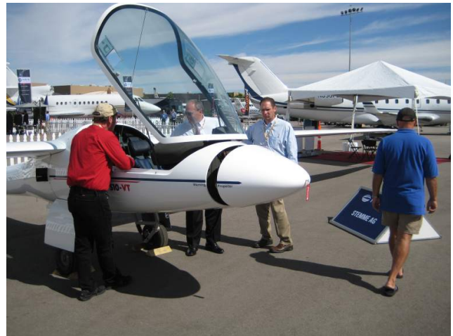
The outstanding, timeless feature of the Stemme S10-VT, the 'fold-away propeller', received all the attention at NBAA in Las Vegas.