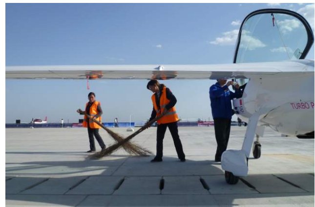
Two of the many very busy cleaning ladies sweeping the apron every morning.