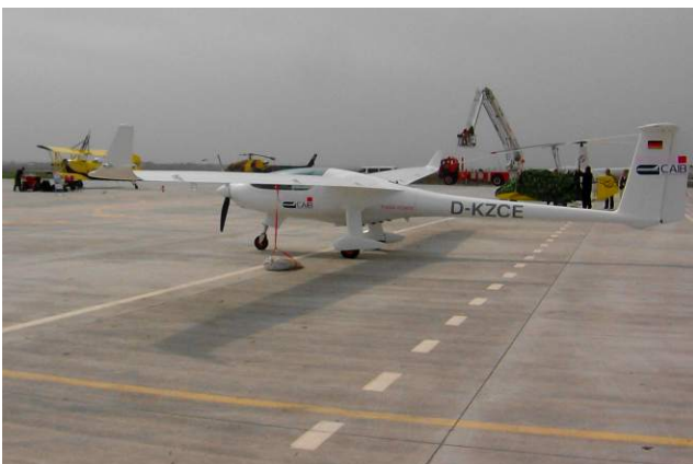
Flightline Xi'an in the morning: the S6 being readied for the flight program.

General aviation in China is growing fast from a base of about 1000 aircraft today, thanks to the opening-up of lower airspace for VFR flights in three large experimental areas. Aircraft 'Made in Germany' command attention due to their design excellence. STEMME's S6 Travelling Motorglider caught the attention of the Chinese authorities, confirming their intention to become a world player in aviation innovation.