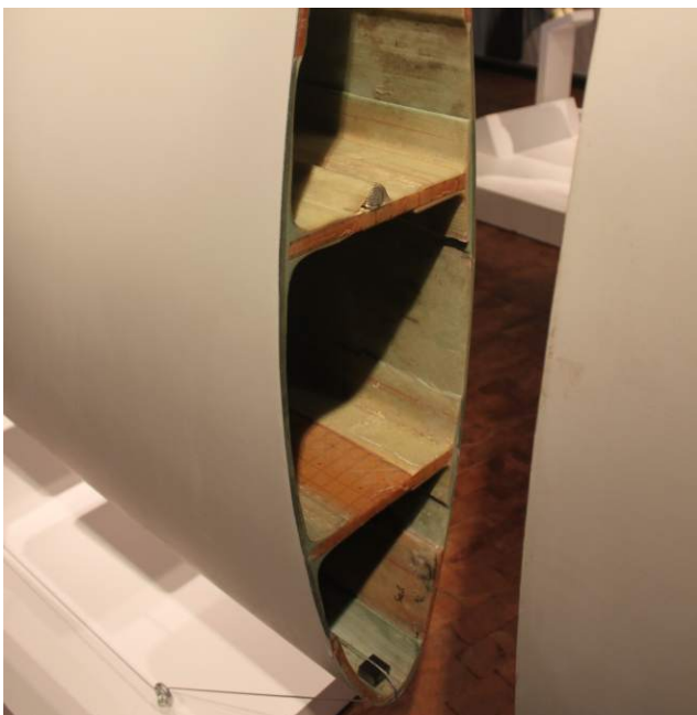
Insight into the wing foil of a wind turbine – the similarities with an aircraft wing are striking.

Wind, the invisible force, has fascinated mankind through the ages. The WIND FORCE exhibition in Berlin, running through spring 2013, presents the tools and contraptions humans invented to partake in the force of wind – many of which evolved into an intricate, clearly artistic form, in order to extract power to generate energy. The 'Mountain Wave Project' (MWP), a research project to explore lee waves and turbulences found behind tall mountains, features prominently in the exhibition. STEMME aircraft play a significant role in the MWP-effort,